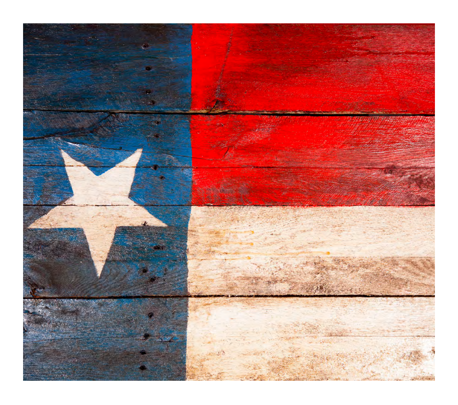
TEXAS March 11 – 17, 2022