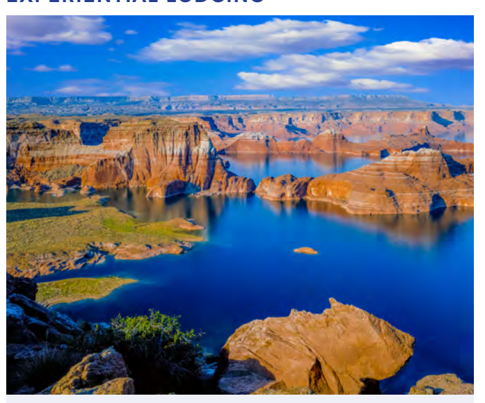
This itinerary features unforgettable lodging experiences. Enjoy marvelous scenery at the Red Cliffs Lodge. Take delight in views of Lake Powell's bright blue waters at the Lake Powell Resort. Stay on the Grand Canyon at the North Rim Lodge. Indulge in the opulence of Las Vegas's Bellagio Resort and Casino.